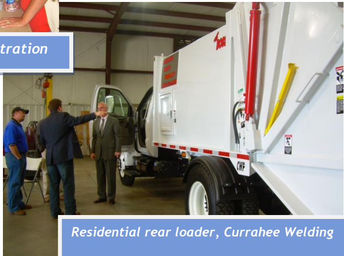
Residential rear loader, Currahee Welding