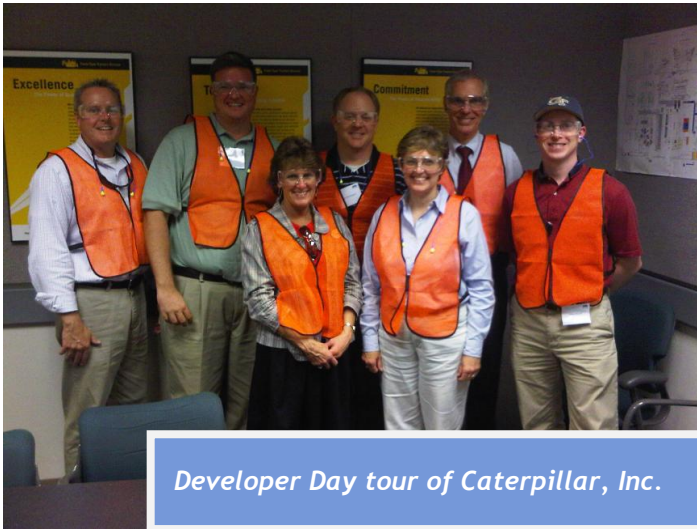
Developer Day tour of Caterpillar, Inc.

line were at 80% at the fiscal year end.