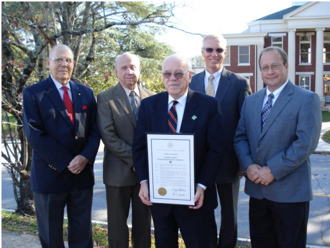
Georgia Work Ready Certified Community award