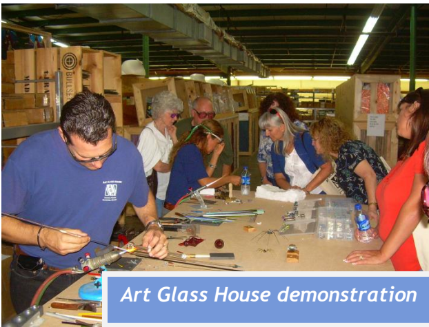
Art Glass House demonstration