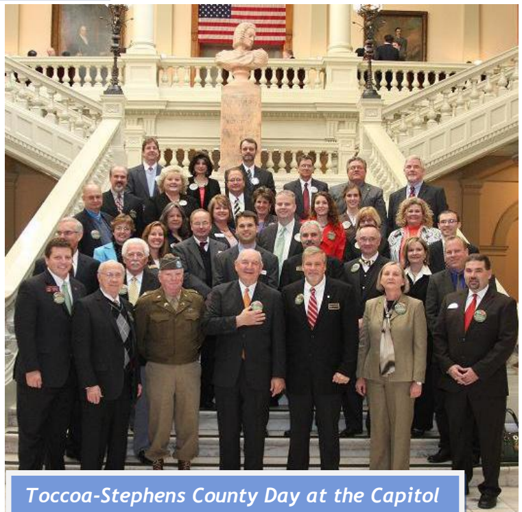
Toccoa-Stephens County Day at the Capitol