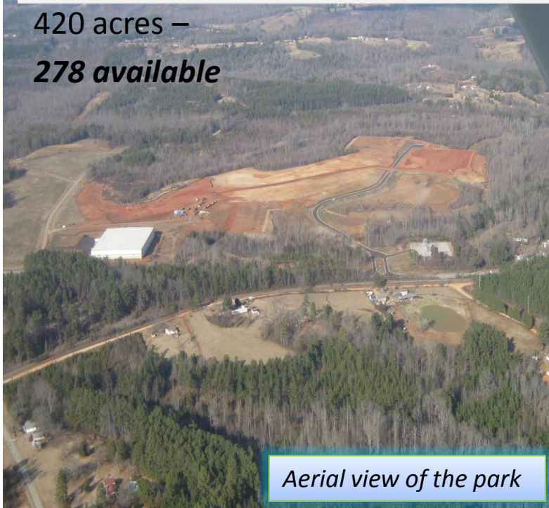
Aerial view of the park