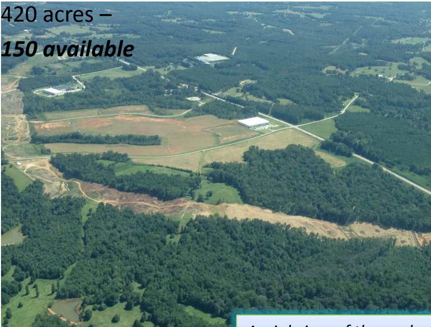
Aerial view of the park